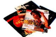
Magazines & catalogs